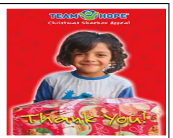
Thank you to all who donated to the Shoe Box Appeal.